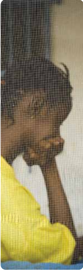
Girl, 13, raped by neighbor (Sierra Leone)