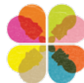
FIGURE 1: RISK FACTORS FOR SEXUAL VIOLENCE VICTIMIZATION AND PERPETRATION