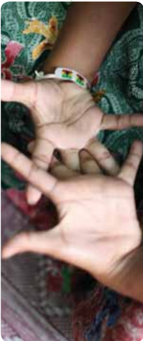
Girl, 16, raped the year before (Thailand)

To be effective, strategies for both the prevention of sexual violence against girls and the provision of services to address its consequences should be based on scientific evidence and subject to ongoing monitoring and evaluation. However, in contrast to other forms of violence against children, such as child physical abuse by parents and bullying by peers, evidence for the effectiveness of strategies to prevent sexual violence against girls is limited. Strategies that have been widely used to address sexual violence in the United States include offender management and school-based education programs. There is little evidence that the former is effective in preventing sexual violence against children.